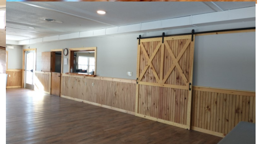
New prominent rental hall features