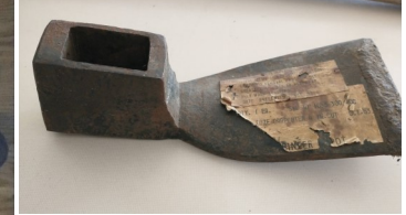
Adze head—for hewing beams