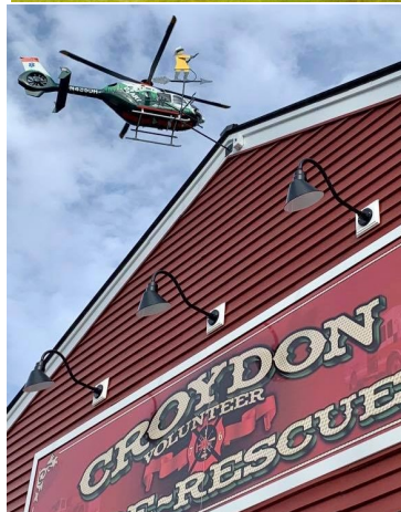
Looks like the restored weathervane is taking a ride upon that DHART helicopter.