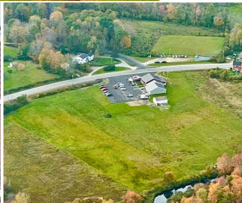
Great aerial view of the CFD showing the ballfield across from it, a prior CFD contribution to the townspeople.

The new shed, for public water jug filling, will be complete soon, as the outdoor well stopped and so many people rely on this drinking water source. A new paved parking lot and landscape features make the CFD look pretty impressive.