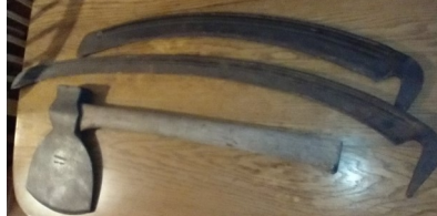
Broad axe and Sibley scythe blades