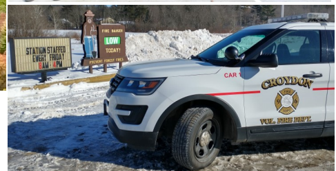
EMERGENCY RESPONSE VEHICLE