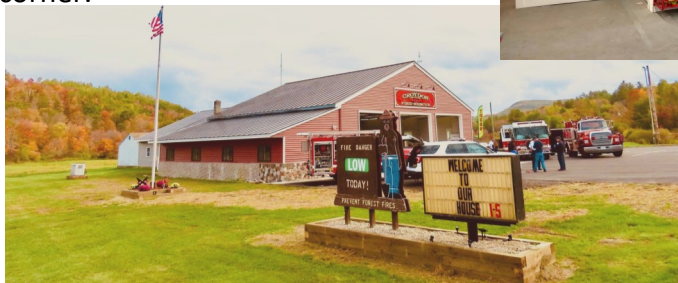
Office and meeting room addition, old office area now equipment lockers/storage

The new office addition includes a meeting area, the old office in the station is now locker storage. The hall has been renovated with top to bottom paint, lighting, flooring, doors, wainscot, even a gas fireplace for ambient effect for rental events. The piano from us now has proper placement in the corner.