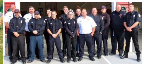
2021 crew members of Croydon Volunteer Fire and Rescue Department