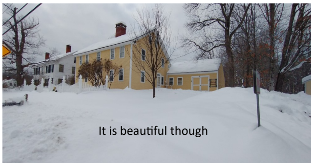
It is beautiful though