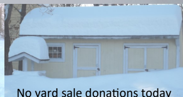
No yard sale donations today